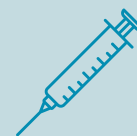
People who use substances