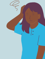
Confusion/ Dizziness/ Fainting