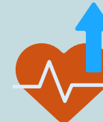
Rapid Heart Rate