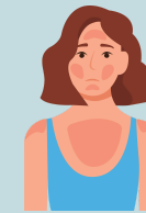
Flushed skin with no sweating