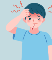
High Body Temperature